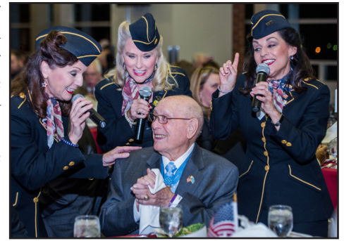
The Ladies for Liberty with Woody Williams

The EFKY would like to thank the following sponsors for the Kentucky banquet: Campbellsville University, Karl Truman Law, First Command, Oldham County History Center, Middleton Reutlinger, BBMC Mortgage, L&N Federal Credit Union, Paralyzed Veterans of America Kentucky-Indiana Chapter, and Riches and Glory Photography. For the Indiana banquet, thanks to: Karl Truman Law, Stemler Corporation, and IBI.