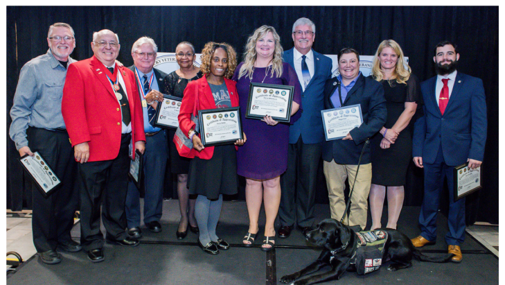
2017 Nominees for & Winners of the Kentucky Veterans of the Year Award