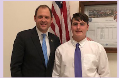
U.S. Congressman Andy Barr and Jackson Sturgeon

*This program is made possible with funding from the Centers for Disease Control and Prevention (CDC) under cooperative agreement number 1U58DP0026256-02-00, CFDA 93.850. Its contents are solely the responsibility of the authors and do not necessarily represent the views of the CDC.